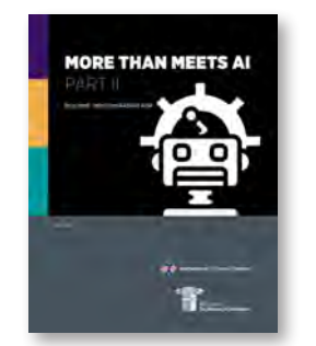
More than Meets AI— Part II: Building Trust, Managing Risk