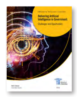
Delivering Artificial Intelligence in Government: Challenges and Opportunities

For more research on AI in government visit businessofgovernment.org and search artificial intelligence.