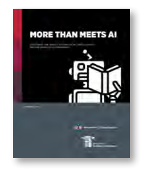
More Than Meets AI: Assessing the Impact of Artificial Intelligence on the Work of Government