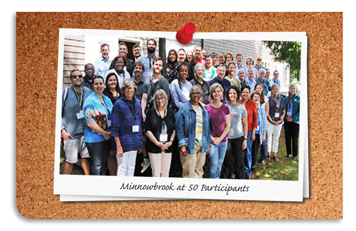
29. Phase two of Minnowbrook III may have been more diverse, but with over 200 participants, it was also much larger and held off-site. 30. Minnowbrook conferences always trigger questions about who gets to participate. There are not enough opportunities for people in public administration to come together and have extended, meaningful conversations about our field. Minnowbrook at 50 strived to be as inclusive and diverse as possible given the limited space at the conference center. Members of the faculty committee and advisory board nominated people who could engage big questions and stimulate new ways of looking at challenging issues. Through voting, numerous discussions, and countless emails, a list of participants was constructed.

As with previous Minnowbrook conferences, participants came together to step out of their comfort zones, challenge the status quo, push the field in new and interesting ways, and drive greater value from scholarship for practitioners. Minnowbrook at 50 is the most diverse Minnowbrook convening to date.<sup>29</sup> The conference had 44 participants (see Appendix C), including an almost equal number of women and men, significant representation from people of color, and scholars at all ranks and from schools beyond the traditional "top" programs.<sup>30</sup> For the first time, it also included practitioners in an effort to reestablish the relevance of public administration scholarship. In addition, to expand the dialogue across the public administration community, Minnowbrook at 50 was followed by roundtable sessions at several conferences and many online discussions.