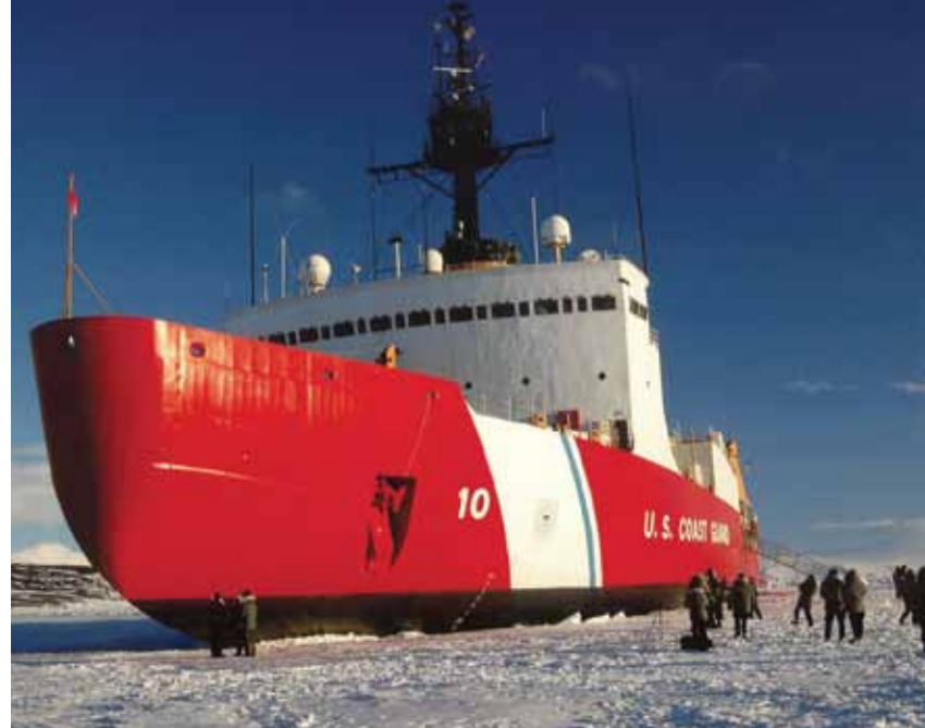
The upward angle of Polar Star's bow is designed so that the hull rides up onto the ice surface during icebreaking operations.

We are also focusing on the polar regions given our vital national interests. To support this effort, we will accelerate the current acquisition of a heavy icebreaker and plan for additional icebreakers, continue to build unity of effort with the Department of State and other federal and international partners in support of the U.S. Chairmanship of the Arctic Council, advance the Arctic Coast Guard Forum, and support the United Nations Convention on the Law of the Sea (UNCLOS) ratification.