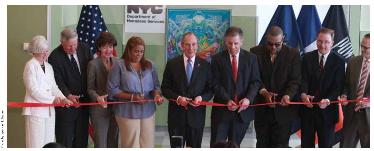
Mayor Bloomberg opens the city's new Prevention Assistance and Temporary Housing (PATH) Center, available to aid homeless families after years of development.

abuse involved. Sometimes it's based on a misperception or an old perception of the shelter system's being a dangerous place where they don't want to go. We've made a real investment through what we call outreach to try and help people on the street get off the street. We have people 24 hours a day, seven days a week, that are out on the city streets, approaching people who are ... living there.