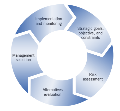
Figure 1: GAO Risk Management Cycle

Acceptance—live with the risk and accept the consequences. Can be useful for small risks