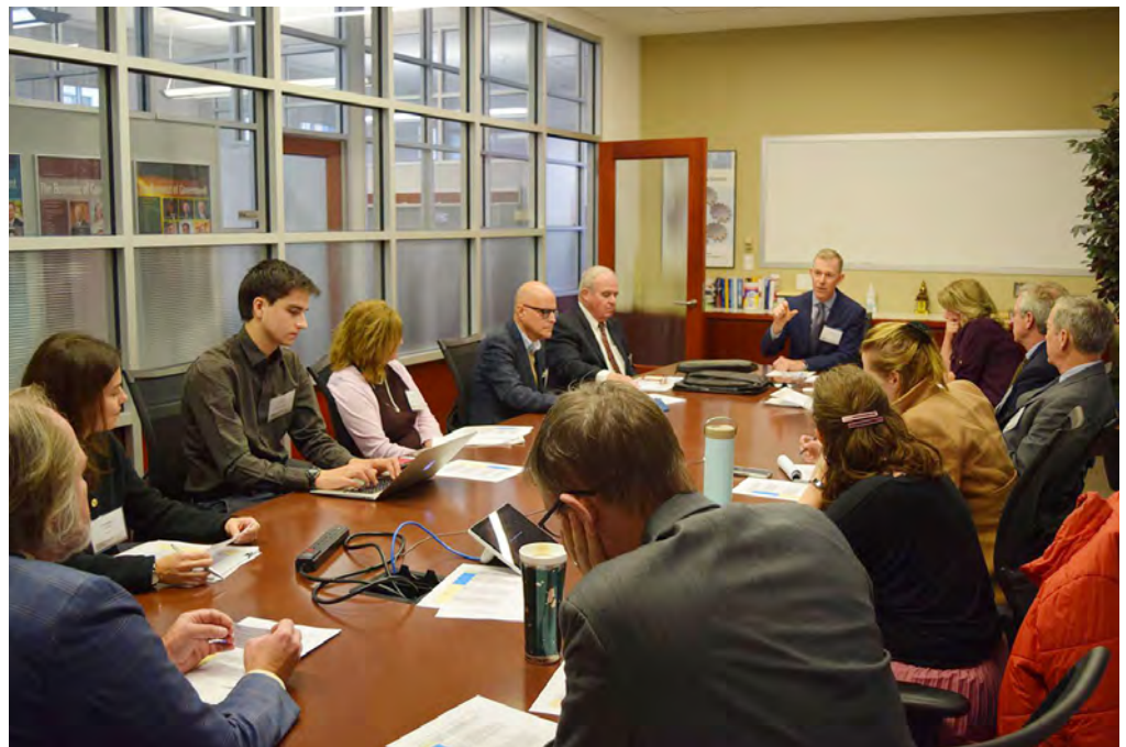
Participants discussed agile regulation

At the same time, some participants noted that agencies could not be expected to take on more responsibilities or oversight without appropriate resources. To reinvent or reform outdated processes, agencies might need financial support to hire external expertise, and integrating AI or retrospective review into workflows is likely to be costly.