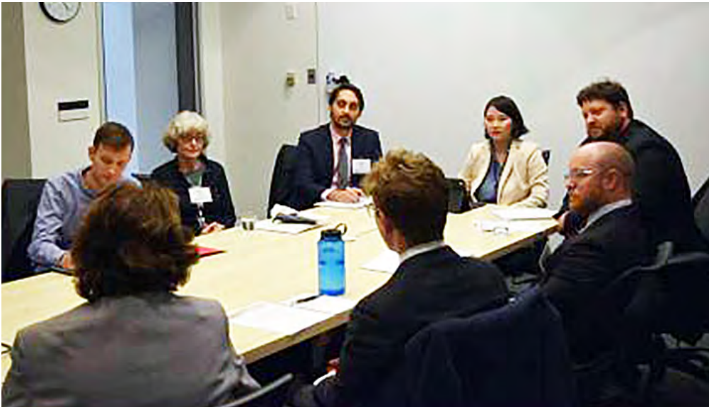
Breakout discussion on improving evidence for retrospective policy analysis

Despite the value of retrospective review, the consensus among session attendees was that agencies have not been doing a good job in retrospective review. There are at least two major challenges .