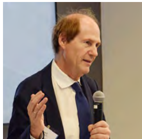
Keynote speaker, Cass Sunstein