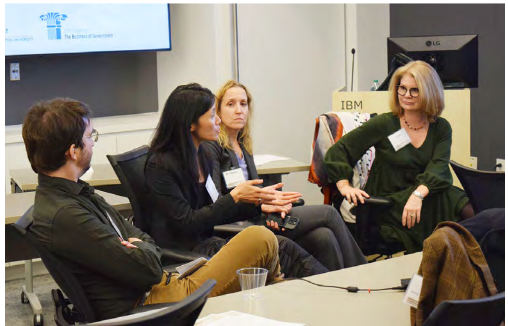
Breakout discussion on generative AI applications to rule development

One participant suggested that agencies using AI systems decouple the procedures for processing comments from those for reviewing their substance, to mitigate the issue of whether they have adequately considered public comments. While AI may serve a key role in categorizing, filtering, and summarizing public submissions, human involvement remains necessary in the latter stage of evaluating substantive feedback. On this topic, participants also deliberated about the role of transparency in how agencies adopt and use AI technologies. Like other technologies, relying on AI too much could distort the rulemaking process, so establishing boundaries and usage policies would aid public accountability. Generally, participants agreed that clear guidance from a body like the Office of Management and Budget on this matter would be valuable.