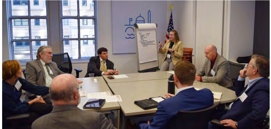
Breakout discussion on the role of technology in public participation in the regulatory process

While AI could certainly improve public commenting if used to support tools such as these, it could also introduce new challenges. For one, would AI dilute substantive comments on big rules? Generative AI—like ChatGPT—gives users a platform to create an individualized public comment with minimal effort. Individuals could use generative AI to quickly write and submit multiple unique comments on a given proposal. While agencies have technology to identify duplicate comments, their technology may not be able to identify and filter out similar but unique comments. More unique comments might make it more challenging for agencies to address all the comments they receive and enact rules.