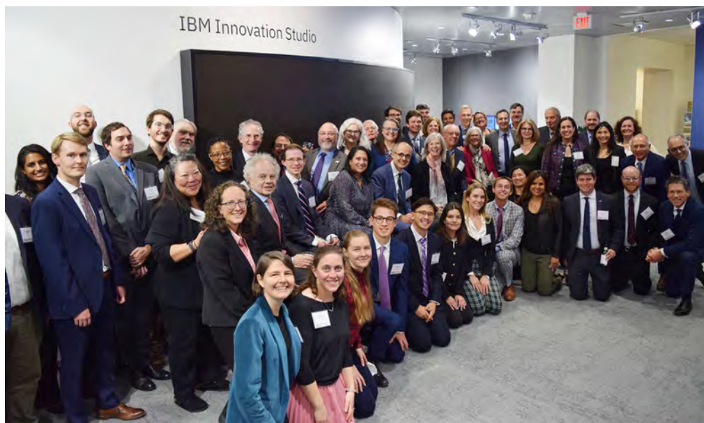
Current and former OIRA staff members celebrate anniversaries of important regulatory milestones.